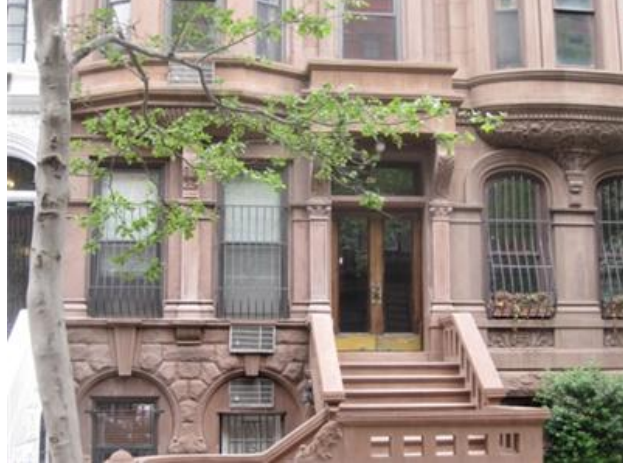
40 West 70th Street.

At the time they bought it, the home was subdivided into 10 rental units. Its listing declared, though, that it could be transformed into “a magnificent single-family residence.” That proved no exaggeration. Located a short walk from Lincoln Center, the house is all but sure to exceed even the most demanding aesthetic standards. Twenty feet wide, with seven stories to its name, it contains seven bedrooms and seven full baths, plus more than 1,000 square feet of exterior breathing room and five separate levels of outdoor space. There is a penthouse addition with north and south facing roof decks, and elevators for both people and comestibles. (The latter, for you plebes, is known as a dumbwaiter; and the opulence of the property is such that one does not have difficulty imagining that it might actually see some use.) Like the